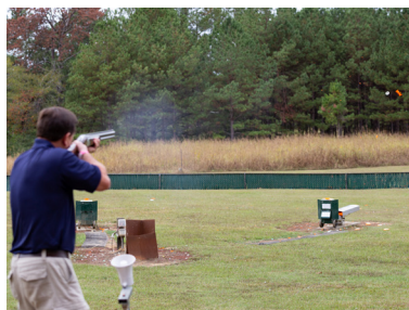
1:00 PM* Afternoon activities begin (sign up required) • EXPO of Shooting activities* - Enjoy some or enjoy them all • Wobble Trap • Long Bird • Pistol Shooting • Recurve bow • Helice