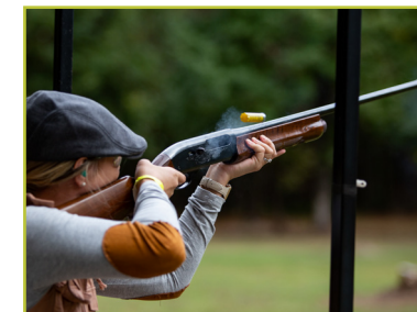
1:00 PM* Afternoon activities begin (sign up required) • EXPO of Shooting activities* - Enjoy some or enjoy them all! • Wobble Trap • Long Bird • Pistol Shooting • Recurve bow • Helice