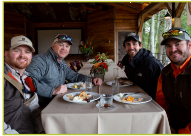
7:30 AM Breakfast and registration

NEW AND EXCITING THIS YEAR! Our signature event! Join us for a fun morning of course shooting, games & prizes, delicious food, and valuable networking opportunities. Stay the afternoon and enjoy great Last Man Standing prizes, a grand variety of shooting games.