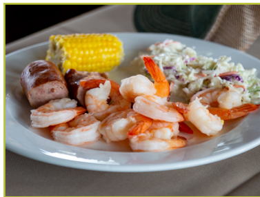
12:00 PM Sit down Low Country Boil BHF Mission moment Team awards presentation