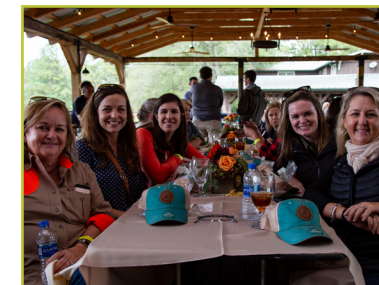
12:00 PM Sit down Low Country Boil BHF Mission moment Team awards presentation