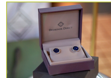
11:30 AM Silent auction tables and Last Man Standing open