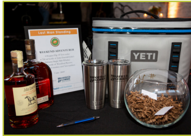
11:30 AM Silent auction tables and Last Man Standing open