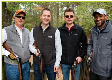
8:30 AM Course Shooting