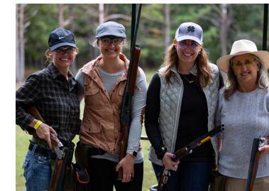
9 - 11:30 AM Course Shooting