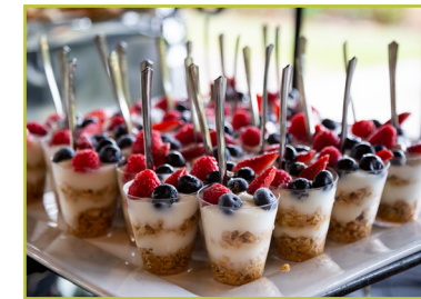
8:00 AM Breakfast and registration